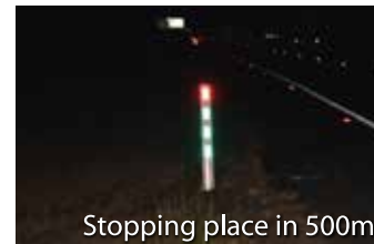
Stopping place in 500m

For further information, please refer to the The Department of Transport and Main Roads 'Technical Note 4.2 Guidelines for "3-2-1 green reflector" informal heavy vehicle stopping places', July 2013