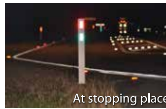
At stopping place