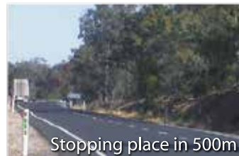
Stopping place in 500m