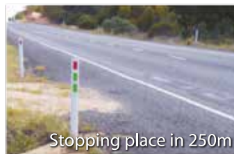
Stopping place in 250m