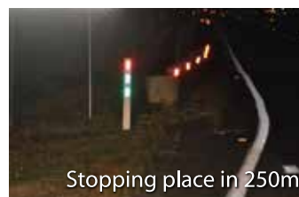
Stopping place in 250m