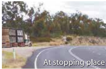
At stopping place